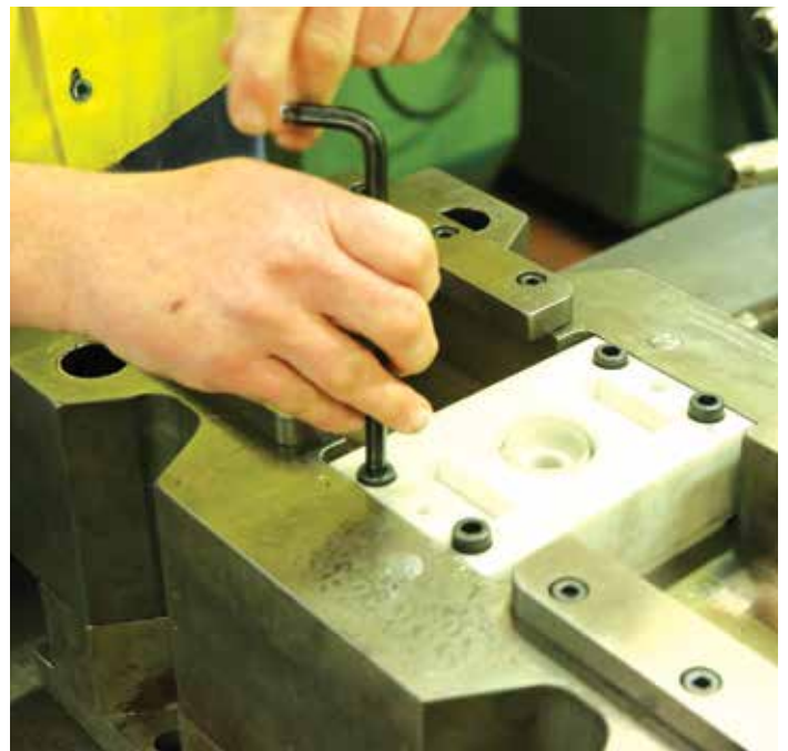
Time and cost considerations led Philmac to explore 3D printing for its production tooling prototype