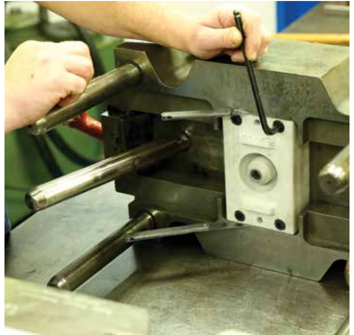
DuraForm HST withstood Philmac's heat and pressure tests and was selected for prototyping

Contact 3D Systems for more information on its complete On Demand Manufacturing services.